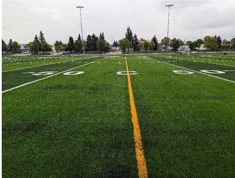
Larry Olexiuk Field