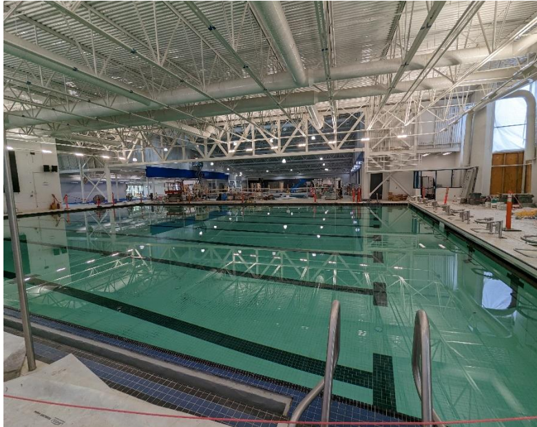
Fountain Park Recreation Center