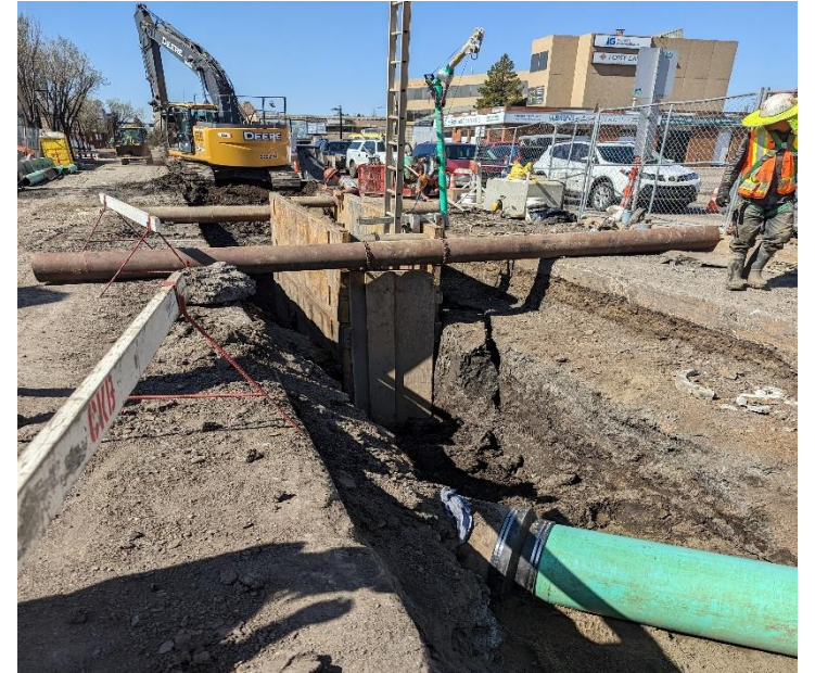
St Anne Street Sanitary